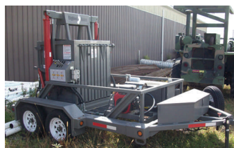
BigFoot Ag Baler