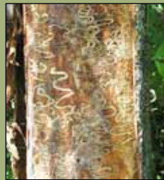
Serpentine galleries - S-shaped feeding tunnels, often with larvae, just under the bark