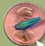
The adult emerald ash borer, slender and metallic green, measures 1/2 inch long and 1/8 inch wide