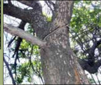
Woodpecker damage on ash tree's trunk and branches