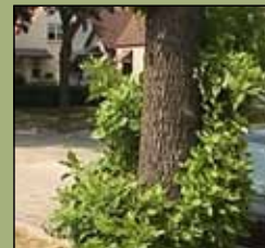
Sucker sprouts grow from the base of the tree