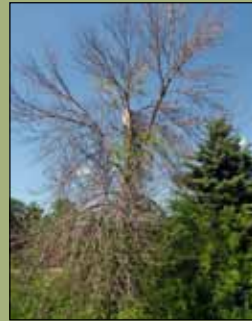
Ash tree branches dying from the top down (known as crown thinning)